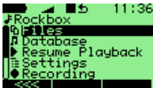
Figure 5.1.: The main menu

The MAIN MENU is the screen from which all of the Rockbox functions can be accessed. This is the first screen you will see when starting Rockbox. To return to the MAIN MENU, press the F1 button.