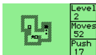
Figure 12.22.: Sokoban