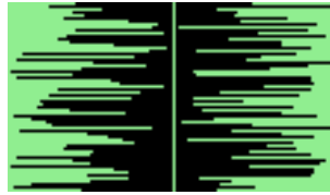
Figure 12.35.: Oscilloscope

This demo shows the shape of the sound samples that make up the music being played.