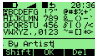
Figure 4.3.: The virtual keyboard

This is the virtual keyboard that is used when entering text in Rockbox, for example when renaming a file or creating a new directory. The virtual keyboard can be easily changed by making a text file with the required layout. More information on how to achieve this can be found on the Rockbox website at LoadableKeyboardLayouts .