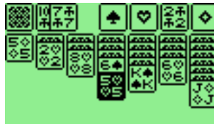
Figure 12.23.: Klondike solitaire