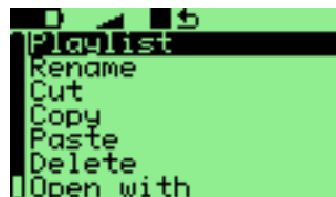
Figure 4.2.: The Context Menu

The CONTEXT MENU allows you to perform certain operations on files or directories. To access the CONTEXT MENU, position the selector over a file or directory and access the context menu with Long Play .