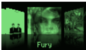
Figure 12.36.: PictureFlow

PictureFlow provides a visualisation of your albums with their associated cover art.