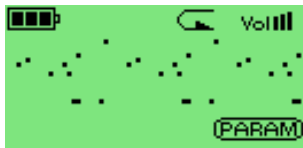
Figure 10.6.: Have you ever seen snow falling?

This demo replicates snow falling on your screen. If you love winter, you will love this demo. Or maybe not. Press Menu or Long Menu to quit.