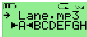
Figure 4.3.: The virtual keyboard

This is the virtual keyboard that is used when entering text in Rockbox, for example when renaming a file or creating a new directory.