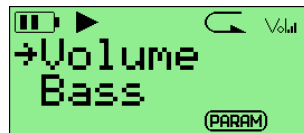
Figure 6.1.: The sound settings screen

The sound settings menu offers a selection of sound settings you may change to customise your listening experience.