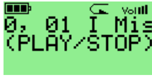
Figure 5.2.: The list bookmarks screen

If the SAVE A LIST OF RECENTLY CREATED BOOKMARKS option is enabled then you can view a list of several recent bookmarks here and select one to jump straight to that track.