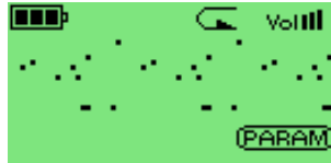
Figure 10.6.: Have you ever seen snow falling?

This demo replicates snow falling on your screen. If you love winter, you will love this demo. Or maybe not. Press Menu or Long Menu to quit.