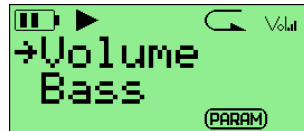
Figure 6.1.: The sound settings screen

The sound settings menu offers a selection of sound settings you may change to customise your listening experience.