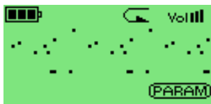
Figure 10.6.: Have you ever seen snow falling?

This demo replicates snow falling on your screen. If you love winter, you will love this demo. Or maybe not. Press Menu or Long Menu to quit.