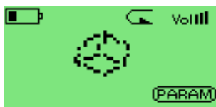
Figure 10.4.: Cube

This is a rotating cube screen saver in 3D.