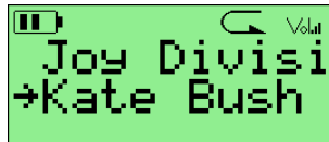
Figure 4.1.: The file browser

Rockbox lets you browse your music in either of two ways. The FILE BROWSER lets you navigate through the files and directories on your player, entering directories and executing the default action on each file. To help differentiate files, each file format is displayed with an icon.