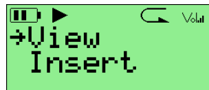
Figure 4.5.: The Playlist Submenu

The PLAYLIST SUBMENU is a submenu in the CONTEXT MENU (see section 4.1.2 (page 19)), it allows you to put tracks into a “dynamic playlist”. If there is no music currently playing, Rockbox will create a new dynamic playlist and put the selected track(s) into it. If there is music currently playing, Rockbox will put the selected track(s) into the current playlist. The place in which the newly selected tracks are added to the playlist is determined by the following options: