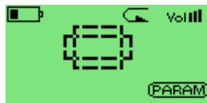
Figure 10.5.: Mosaïque

This simple graphics demo draws a mosaic picture on the screen of the player.