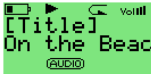
Figure 4.4.: The track info viewer

This screen is accessible from the WPS screen, and provides a detailed view of all the identity information about the current track. This info is known as meta data and is stored in audio file formats to keep information on artist, album etc. To access this screen, press Long Play to access the WPS CONTEXT MENU and select SHOW TRACK INFO. Use Minus and Plus to move through the information.