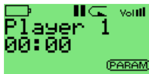
Figure 10.10.: Chess Clock

The chess clock plugin is designed to simulate a chess clock, but it can be used in any kind of game with up to ten players.