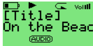
Figure 4.4.: The track info viewer

This screen is accessible from the WPS screen, and provides a detailed view of all the identity information about the current track. This info is known as meta data and is stored in audio file formats to keep information on artist, album etc. To access this screen, press Long Play to access the WPS CONTEXT MENU and select SHOW TRACK INFO. Use Minus and Plus to move through the information.