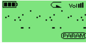
Figure 10.6.: Have you ever seen snow falling?

This demo replicates snow falling on your screen. If you love winter, you will love this demo. Or maybe not. Press Menu or Long Menu to quit.