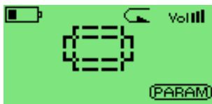
Figure 10.5.: Mosaïque

This simple graphics demo draws a mosaic picture on the screen of the player.