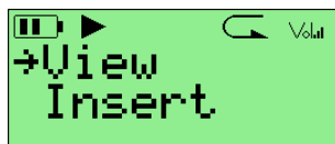
Figure 4.5.: The Playlist Submenu

The PLAYLIST SUBMENU is a submenu in the CONTEXT MENU (see section 4.1.2 (page 19)), it allows you to put tracks into a “dynamic playlist”. If there is no music currently playing, Rockbox will create a new dynamic playlist and put the selected track(s) into it. If there is music currently playing, Rockbox will put the selected track(s) into the current playlist. The place in which the newly selected tracks are added to the playlist is determined by the following options: