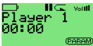
Figure 10.10.: Chess Clock

The chess clock plugin is designed to simulate a chess clock, but it can be used in any kind of game with up to ten players.