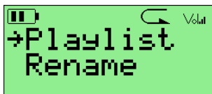
Figure 4.2.: The Context Menu

The CONTEXT MENU allows you to perform certain operations on files or directories. To access the CONTEXT MENU, position the selector over a file or directory and access the context menu with Long Play .