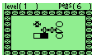
Figure 10.13.: pegbox

To beat each level, you must destroy all of the pegs. If two like pegs are pushed into each other they disappear except for triangles which form a solid block and crosses which