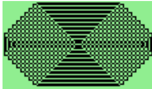
Figure 10.34.: Mosaïque

This simple graphics demo draws a mosaic picture on the screen of the player.