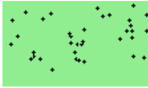
Figure 10.38.: Have you ever seen snow falling?

This demo replicates snow falling on your screen. If you love winter, you will love this demo. Or maybe not. Press On/Off or Long On/Off to quit.