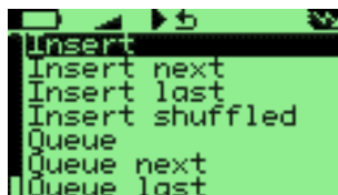
Figure 4.5.: The Playlist Submenu

The PLAYLIST SUBMENU is a submenu in the CONTEXT MENU (see section 4.1.2 (page 21)), it allows you to put tracks into a “dynamic playlist”. If there is no music currently playing, Rockbox will create a new dynamic playlist and put the selected track(s) into it. If there is music currently playing, Rockbox will put the selected track(s) into the current playlist. The place in which the newly selected tracks are added to the playlist is determined by the following options: