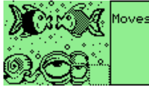
Figure 10.19.: Sliding puzzle

The classic sliding puzzle game. Rearrange the pieces so that you can see the whole picture, or switch to number tiles if you like it a little easier. Includes one picture puzzle. You can also use the sliding puzzle plugin as a viewer for supported image types, to turn your own pictures into a puzzle.