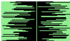
Figure 10.35.: Oscilloscope

This demo shows the shape of the sound samples that make up the music being played.