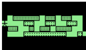
Figure 10.11.: MazezaM

The goal of this puzzle game is to escape a dungeon consisting of ten “mazedams”. These are rooms containing rows of blocks which can be shifted left or right. You can move the rows only by pushing them and if you move the rows carelessly, you will get stuck. You can have another go by selecting “retry level” from the menu, but this will cost you a life. You start the game with three lives. Luckily, there are checkpoints at levels four and eight.