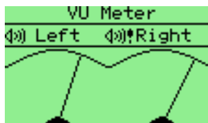
Figure 10.40.: VU-Meter

This is a VU meter, which displays the volume of the left and right audio channels. There are 3 types of meter selectable. The analogue meter is a classic needle style. The digital meter is modelled after LED volume displays, and the mini-meter option allows for the display of small meters in addition to the main display (as above). From the settings menu the decay time for the meter (its memory), the meter type and the meter scale can be changed.