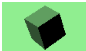
Figure 10.30.: Cube

This is a rotating cube screen saver in 3D.