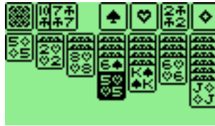
Figure 10.23.: Klondike solitaire

This is the classic Klondike solitaire game for Rockbox. This is probably the best-known solitaire in the world. Many people do not even realize that other games exist. Though the name may not be familiar, the game itself certainly is. This is due in no small part to Microsoft's inclusion of the the game in every version of Windows. Though popular, the odds of winning are rather low, perhaps one in thirty hands.