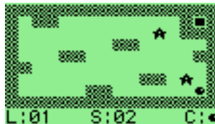
Figure 10.25.: Star game

This is a puzzle game. It is actually a rewrite of Star, a game written by CDK designed for the hp48 calculator.