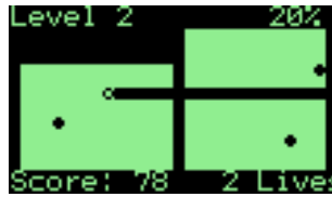
Figure 10.28.: Xbox

Xobox is a simple clone of the well known arcade game Qix. The aim of the game is to section off parts of the arena with your trail in order to remove that section from the game. Be careful not to get in the way of enemy balls because, if they hit you or your trail, you lose a life. To finish a level you have to section off more than 75%.