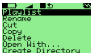
Figure 4.2.: The Context Menu

The CONTEXT MENU allows you to perform certain operations on files or directories. To access the CONTEXT MENU, position the selector over a file or directory and access the context menu with Long Right .