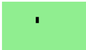
Figure 10.20.: Snake