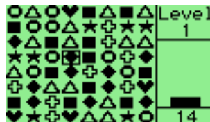
Figure 10.10.: Jewels

Jewels is a simple yet addicting game which involves swapping pairs of jewels in order to form connected segments of three or more of the same type.