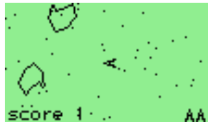
Figure 10.24.: Spacerocks

Spacerocks is a clone of the old arcade game Asteroids. The goal of the game is to blow up the asteroids and avoid being hit by them. Once in a while, a UFO will appear – shoot this for extra points.