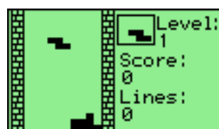
Figure 10.16.: Rockblox

Rockblox is a Rockbox version of the classic falling blocks game from Russia. The aim of the game is to make the falling blocks of different shapes form full rows. Whenever