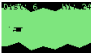
Figure 10.6.: Chopper

Navigate a cavernous maze without banging into walls, the ceiling, or the floor. How long can you fly your chopper?