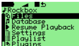
Figure 5.1.: The main menu

The MAIN MENU is the screen from which all of the Rockbox functions can be accessed. This is the first screen you will see when starting Rockbox. To return to the MAIN MENU, hold the Mode button.