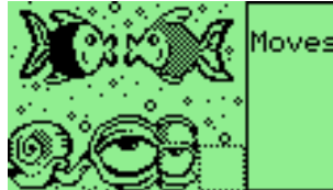
Figure 10.19.: Sliding puzzle

The classic sliding puzzle game. Rearrange the pieces so that you can see the whole picture, or switch to number tiles if you like it a little easier. Includes one picture puzzle. You can also use the sliding puzzle plugin as a viewer for supported image types, to turn your own pictures into a puzzle.