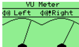
Figure 10.40.: VU-Meter

This is a VU meter, which displays the volume of the left and right audio channels. There are 3 types of meter selectable. The analogue meter is a classic needle style. The digital meter is modelled after LED volume displays, and the mini-meter option allows for the display of small meters in addition to the main display (as above). From the settings menu the decay time for the meter (its memory), the meter type and the meter scale can be changed.