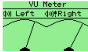
Figure 10.40.: VU-Meter

This is a VU meter, which displays the volume of the left and right audio channels. There are 3 types of meter selectable. The analogue meter is a classic needle style. The digital meter is modelled after LED volume displays, and the mini-meter option allows for the display of small meters in addition to the main display (as above). From the settings menu the decay time for the meter (its memory), the meter type and the meter scale can be changed.