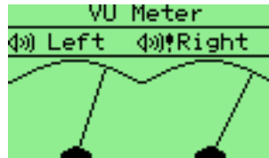
Figure 10.40.: VU-Meter

This is a VU meter, which displays the volume of the left and right audio channels. There are 3 types of meter selectable. The analogue meter is a classic needle style. The digital meter is modelled after LED volume displays, and the mini-meter option allows for the display of small meters in addition to the main display (as above). From the settings menu the decay time for the meter (its memory), the meter type and the meter scale can be changed.