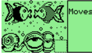
Figure 10.19.: Sliding puzzle

The classic sliding puzzle game. Rearrange the pieces so that you can see the whole picture, or switch to number tiles if you like it a little easier. Includes one picture puzzle. You can also use the sliding puzzle plugin as a viewer for supported image types, to turn your own pictures into a puzzle.