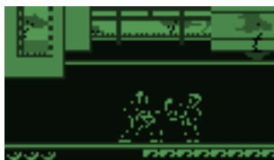
Figure 10.45.: ZXBox

ZXBox is a port of the “Spectemu” ZX Spectrum 48k emulator for Rockbox ( https://sourceforge.net/projects/spectemu/ ). To start a game open a tape file or snapshot saved as .tap , .tzx , .z80 or .sna in the file browser.