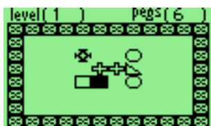
Figure 10.13.: pegbox

To beat each level, you must destroy all of the pegs. If two like pegs are pushed into each other they disappear except for triangles which form a solid block and crosses which