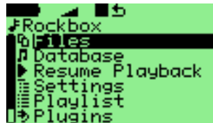
Figure 5.1.: The main menu

The MAIN MENU is the screen from which all of the Rockbox functions can be accessed. This is the first screen you will see when starting Rockbox. To return to the MAIN MENU, hold the Mode button.