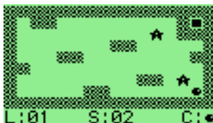
Figure 10.25.: Star game

This is a puzzle game. It is actually a rewrite of Star, a game written by CDK designed for the hp48 calculator.