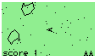
Figure 10.24.: Spacerocks

Spacerocks is a clone of the old arcade game Asteroids. The goal of the game is to blow up the asteroids and avoid being hit by them. Once in a while, a UFO will appear – shoot this for extra points.