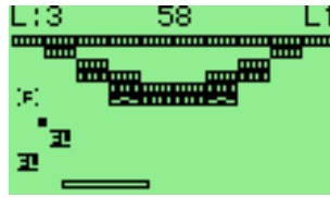
Figure 10.3.: BrickMania

BrickMania is a clone of the classic game Breakout. The aim of the game is to destroy all the bricks by hitting them with the ball once or more. Sometimes a special item falls down when you destroy a brick. For a special item to take effect, you must catch it with the paddle. Look out for the bad ones.