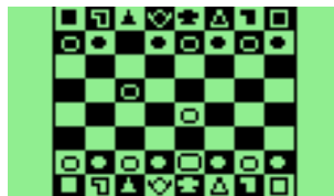
Figure 11.5.: Chessbox

Chessbox is a one-person chess game with computer artificial intelligence. The chess engine is a port of GNU Chess 2 by John Stanback.