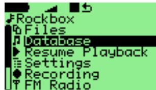
Figure 5.1.: The main menu

The MAIN MENU is the screen from which all of the Rockbox functions can be accessed. This is the first screen you will see when starting Rockbox. To return to the MAIN MENU, hold the Mode button.