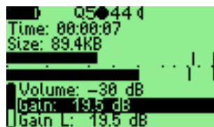
Figure 5.3.: The while recording screen

Selecting the RECORDING option in the MAIN MENU enters the RECORDING SCREEN, whilst pressing Long Right enters the RECORDING SETTINGS (see section 10 (page 64)). The RECORDING SCREEN shows the time elapsed and the size of the file being recorded. A peak meter is present to allow you set gain correctly. There is also a volume setting, this will only affect the output level of the player and does not affect the recorded sound. If enabled in the peak meter settings, a counter in front of the peak meters shows the number of times the clip indicator was activated during recording. The counter is reset to zero when starting a new recording.