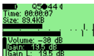
Figure 5.3.: The while recording screen

Selecting the RECORDING option in the MAIN MENU enters the RECORDING SCREEN, whilst pressing Long Right enters the RECORDING SETTINGS (see section 10 (page 64)). The RECORDING SCREEN shows the time elapsed and the size of the file being recorded. A peak meter is present to allow you set gain correctly. There is also a volume setting, this will only affect the output level of the player and does not affect the recorded sound. If enabled in the peak meter settings, a counter in front of the peak meters shows the number of times the clip indicator was activated during recording. The counter is reset to zero when starting a new recording.