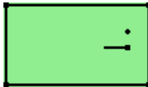
Figure 11.21.: Snake 2 – The Snake Strikes Back

Another version of the Snake game. Move the snake around, and eat the apples that pop up on the screen. Each time an apple is eaten, the snake gets longer. The game ends when the snake hits a wall, or runs into itself.