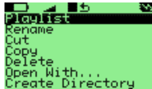
Figure 4.2.: The Context Menu

The CONTEXT MENU allows you to perform certain operations on files or directories. To access the CONTEXT MENU, position the selector over a file or directory and access the context menu with Long Right .