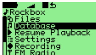
Figure 5.1.: The main menu

The MAIN MENU is the screen from which all of the Rockbox functions can be accessed. This is the first screen you will see when starting Rockbox. To return to the MAIN MENU, hold the Mode button.