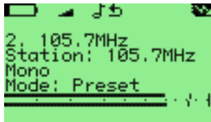
Figure 5.4.: The FM radio screen

This menu option switches to the radio screen. The FM radio has the ability to remember station frequency settings (presets). Since stations and their frequencies vary depending on location, it is possible to load these settings from a file. Such files should have the filename extension .fmr and reside in the directory /.rockbox/fmpresets (note that this directory does not exist after the initial Rockbox installation; you should create it manually). To load the settings, i.e. a set of FM stations, from a preset file, just “play” it from the file browser. Rockbox will “remember” and use it in PRESET mode until another file has been selected. Some preset files are available here: FmPresets .