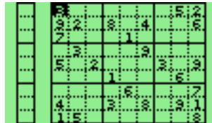
Figure 11.26.: Sudoku

Sudoku in Rockbox can act as both a plugin and a viewer. When starting Sudoku from the BROWSE PLUGINS menu, a random game will be generated automatically, and an estimate of its difficulty (very easy, easy, medium, hard or fiendish) will be displayed on the screen. New games can be generated from the GENERATE menu option. When “playing” an existing Sudoku game file from Rockbox’ file browser the plugin is invoked as viewer. The selected Sudoku will get loaded and you can start solving it. The sudoku games need to be stored as text files with the extension .ss as single file per game.