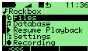
Figure 5.1.: The main menu

The MAIN MENU is the screen from which all of the Rockbox functions can be accessed. This is the first screen you will see when starting Rockbox. To return to the MAIN MENU, press the F1 button.