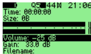
Figure 5.3.: The while recording screen

Selecting the RECORDING option in the MAIN MENU enters the RECORDING SCREEN, whilst pressing Long Play enters the RECORDING SETTINGS (see section 10 (page 70)). The RECORDING SCREEN shows the time elapsed and the size of the file being recorded. A peak meter is present to allow you set gain correctly. There is also a volume setting, this will only affect the output level of the player and does not affect the recorded sound. If enabled in the peak meter settings, a counter in front of the peak meters shows the number of times the clip indicator was activated during recording. The counter is reset to zero when starting a new recording.