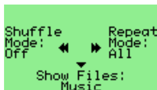
Figure 4.5.: The F2 quick screen