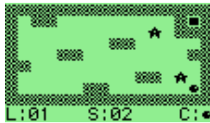
Figure 12.25.: Star game

This is a puzzle game. It is actually a rewrite of Star, a game written by CDK designed for the hp48 calculator.