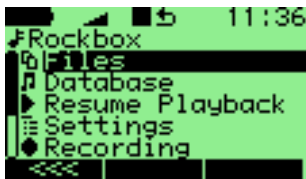
Figure 5.1.: The main menu

The MAIN MENU is the screen from which all of the Rockbox functions can be accessed. This is the first screen you will see when starting Rockbox. To return to the MAIN MENU, press the F1 button.