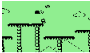
Figure 12.41.: Rockboy

Rockboy is a Nintendo Game Boy and Game Boy Color emulator for Rockbox based on the gnuboy emulator. To start a game, open a ROM file saved as .gb or .gbc in the file browser.