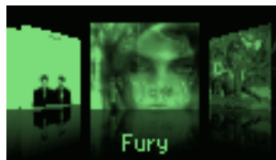
Figure 12.36.: PictureFlow

PictureFlow provides a visualisation of your albums with their associated cover art.