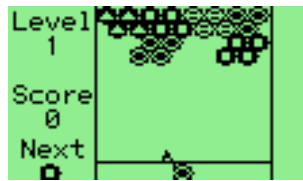
Figure 12.4.: Bubbles

The goal of the game is to beat each level as quickly as possible by clearing the board of all bubbles. Bubbles are removed from the board when a cluster of three or more of the same type is formed. The game is over when any bubbles on the board extend below the bottom line. To make things more difficult, the entire board is shifted down every time a certain number of shots have been fired. Points are awarded depending on how quickly the level was completed.