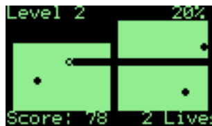
Figure 12.28.: Xbox

Xobox is a simple clone of the well known arcade game Qix. The aim of the game is to section off parts of the arena with your trail in order to remove that section from the game. Be careful not to get in the way of enemy balls because, if they hit you or your trail, you lose a life. To finish a level you have to section off more than 75%.