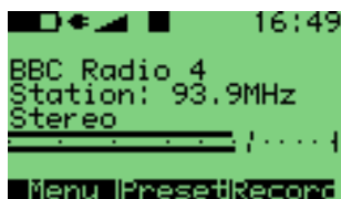
Figure 5.4.: The FM radio screen

This menu option switches to the radio screen. The FM radio has the ability to remember station frequency settings (presets). Since stations and their frequencies vary depending on location, it is possible to load these settings from a file. Such files should have the filename extension .fmr and reside in the directory /.rockbox/fmpresets (note that this directory does not exist after the initial Rockbox installation; you should create it manually). To load the settings, i.e. a set of FM stations, from a preset file, just