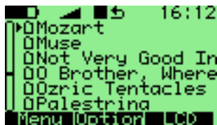
Figure 4.1.: The file browser

Rockbox lets you browse your music in either of two ways. The FILE BROWSER lets you navigate through the files and directories on your player, entering directories and executing the default action on each file. To help differentiate files, each file format is displayed with an icon.