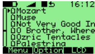
Figure 4.1.: The file browser

Rockbox lets you browse your music in either of two ways. The FILE BROWSER lets you navigate through the files and directories on your player, entering directories and executing the default action on each file. To help differentiate files, each file format is displayed with an icon.