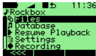
Figure 5.1.: The main menu

The MAIN MENU is the screen from which all of the Rockbox functions can be accessed. This is the first screen you will see when starting Rockbox. To return to the MAIN MENU, press the F1 button.