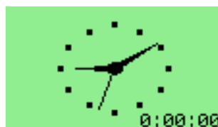
Figure 12.49.: Clock

This is a fully featured analogue and digital clock plugin.