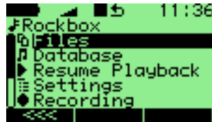
Figure 5.1.: The main menu

The MAIN MENU is the screen from which all of the Rockbox functions can be accessed. This is the first screen you will see when starting Rockbox. To return to the MAIN MENU, press the F1 button.