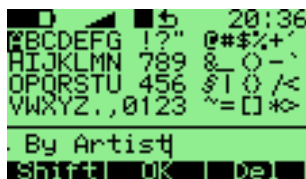
Figure 4.3.: The virtual keyboard

This is the virtual keyboard that is used when entering text in Rockbox, for example when renaming a file or creating a new directory. The virtual keyboard can be easily changed by making a text file with the required layout. More information on how to achieve this can be found on the Rockbox website at LoadableKeyboardLayouts .