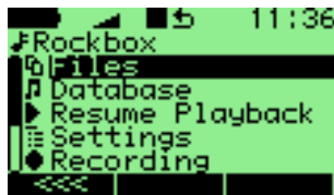
Figure 5.1.: The main menu

The MAIN MENU is the screen from which all of the Rockbox functions can be accessed. This is the first screen you will see when starting Rockbox. To return to the MAIN MENU, press the F1 button.