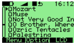
Figure 4.1.: The file browser

Rockbox lets you browse your music in either of two ways. The FILE BROWSER lets you navigate through the files and directories on your player, entering directories and executing the default action on each file. To help differentiate files, each file format is displayed with an icon.