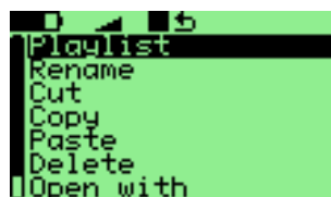
Figure 4.2.: The Context Menu

The CONTEXT MENU allows you to perform certain operations on files or directories. To access the CONTEXT MENU, position the selector over a file or directory and access the context menu with Long Play .