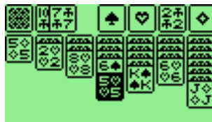
Figure 12.23.: Klondike solitaire