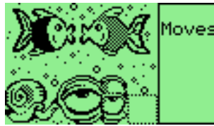
Figure 12.19.: Sliding puzzle

The classic sliding puzzle game. Rearrange the pieces so that you can see the whole picture, or switch to number tiles if you like it a little easier. Includes one picture puzzle. You can also use the sliding puzzle plugin as a viewer for supported image types, to turn your own pictures into a puzzle.