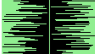
Figure 12.35.: Oscilloscope

This demo shows the shape of the sound samples that make up the music being played.