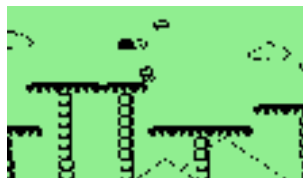
Figure 12.41.: Rockboy

Rockboy is a Nintendo Game Boy and Game Boy Color emulator for Rockbox based on the gnuboy emulator. To start a game, open a ROM file saved as .gb or .gbc in the file browser.