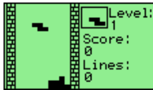
Figure 12.18.: Rockblox

Rockblox is a Rockbox version of the classic falling blocks game from Russia. The aim of the game is to make the falling blocks of different shapes form full rows. Whenever a row is completed, it will be cleared away, and you gain points. For every ten lines completed, the game level increases, making the blocks fall faster. If the pile of blocks reaches the ceiling, the game is over.